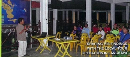
SHARING HIS FINDINGS WITH THE LOCAL TOUR OPERATORS IN LANGKAWI